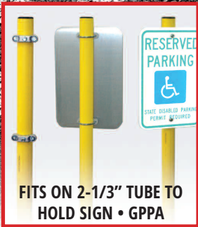
FITS ON 2-1/3" TUBE TO HOLD SIGN • GPPA