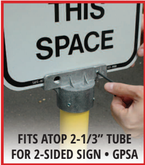
FITS ATOP 2-1/3" TUBE FOR 2-SIDED SIGN • GPSA