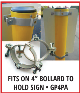
FITS ON 4" BOLLARD TO HOLD SIGN • GP4PA