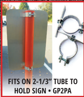
FITS ON 2-1/3" TUBE TO HOLD SIGN • GP2PA