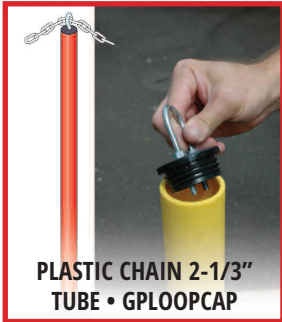
PLASTIC CHAIN 2-1/3" TUBE • GPLOOPCAP