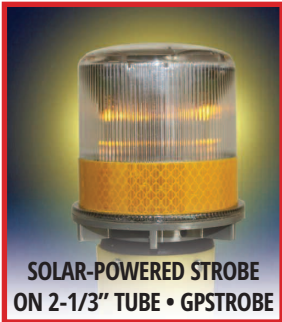
SOLAR-POWERED STROBE ON 2-1/3" TUBE • GPSTROBE