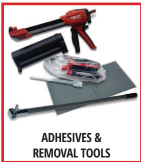
ADHESIVES & REMOVAL TOOLS