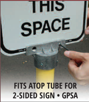
FITS ATOP TUBE FOR 2-SIDED SIGN • GPSA