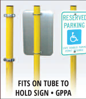
FITS ON TUBE TO HOLD SIGN • GPPA

Accessories For The 2-1/3" Delineator Posts Only