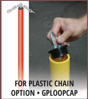
FOR PLASTIC CHAIN OPTION • GPLOOPCAP