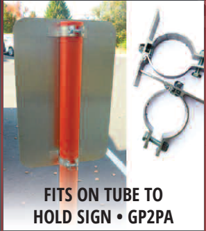
FITS ON TUBE TO HOLD SIGN • GP2PA